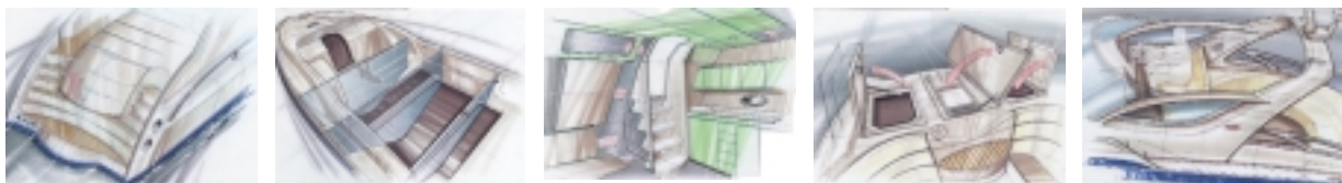
Parabeam Industrie- en Handelsonderneming b.v.