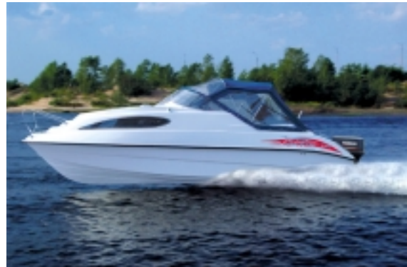
Motorboat Vector Si.

The Plast Group is one of the largest Russian manufacturers of fibreglass products. Since 1994 it has developed from a small workshop into a large factory producing over 100 products under 4 major division: vehicle spare parts and accessories; boats and motorboats; bath tubs and kitchen sinks; children playgrounds.